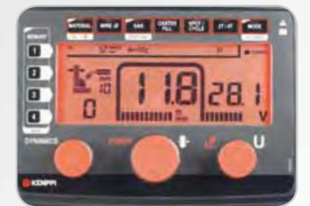
Kempact A control panel interface