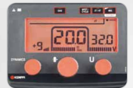
Kempact R control panel interface

Adaptive (A) models combine all standard features, plus Channel memory function and Adaptive mode set-up, where welding power is automatically set according to welding plate thickness selection.